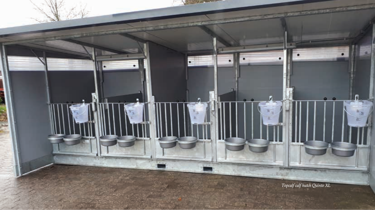
Topcalf calf hutch Quinto XL