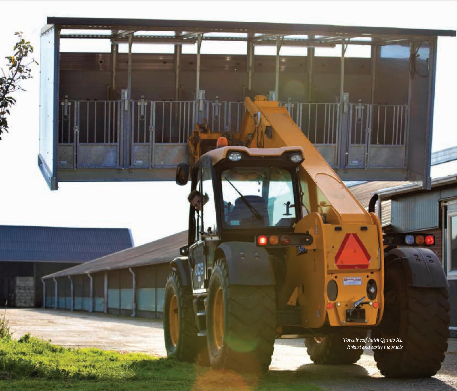
Topcalf calf hutch Quinto XL Robust and easily moveable