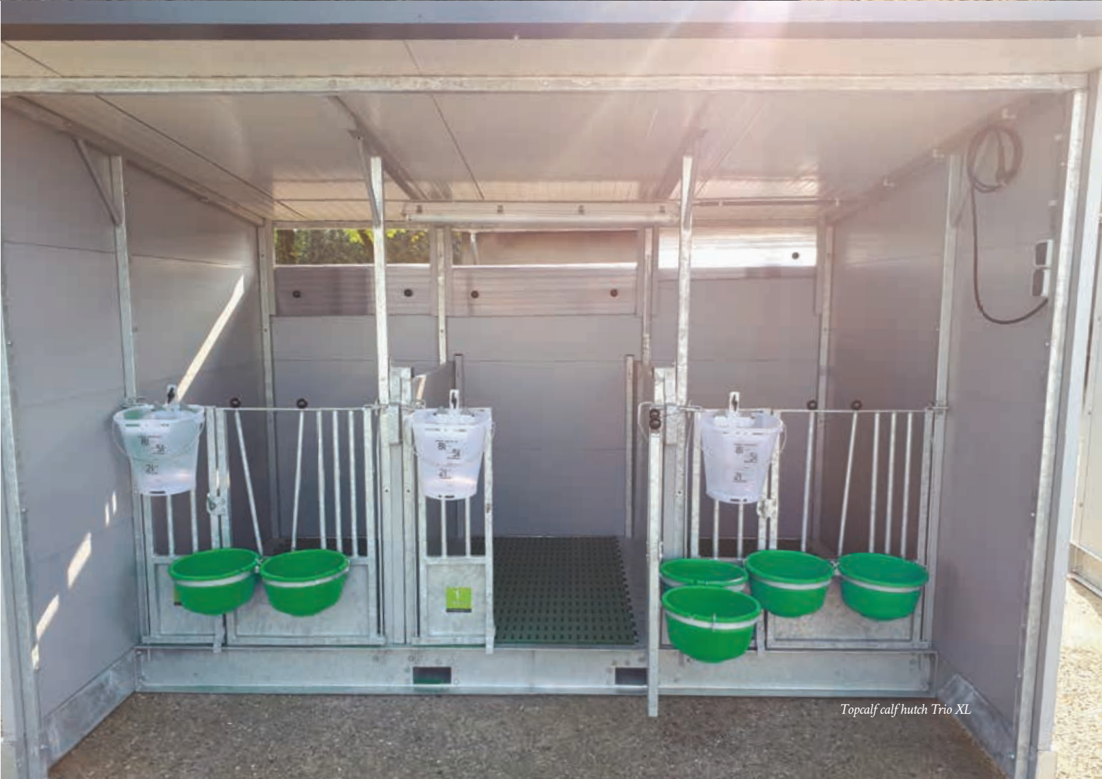
Topcalf calf hutch Trio XL