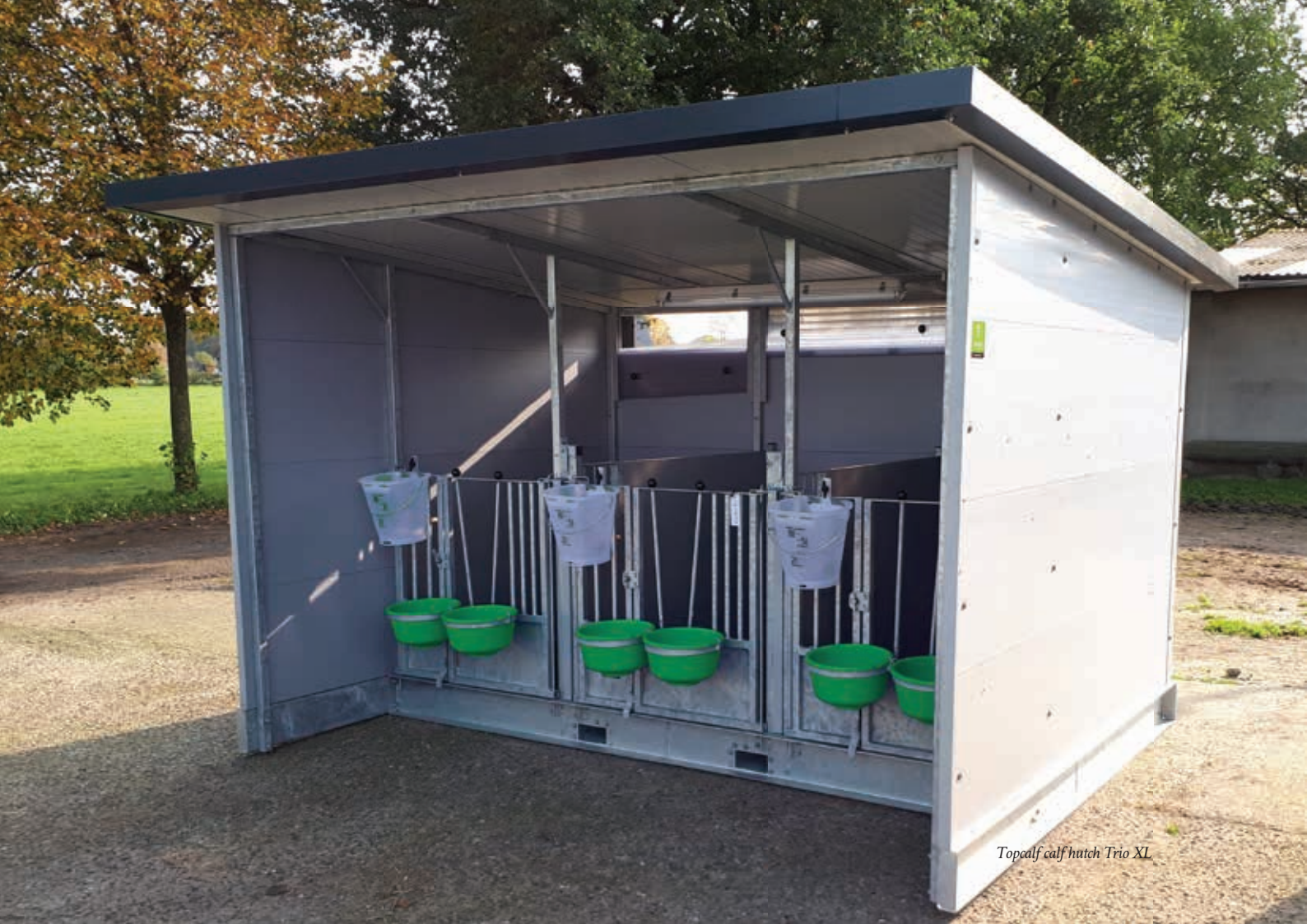
Topcalf calf hutch Trio XL